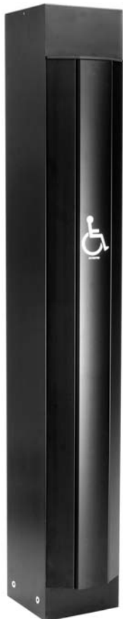
BOLLARD MOUNTED (optional)