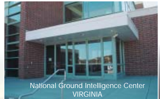
National Ground Intelligence Center VIRGINIA