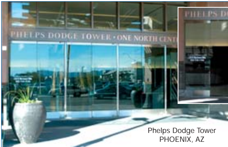
Phelps Dodge Tower PHOENIX, AZ

The Next Generation in WIKK Door Operating Products