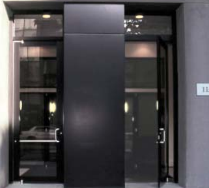
Elm Tower Condominiums CHICAGO, IL